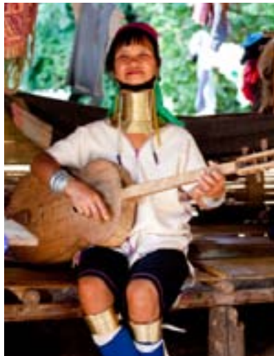
Chiang Mai woman, Thailand