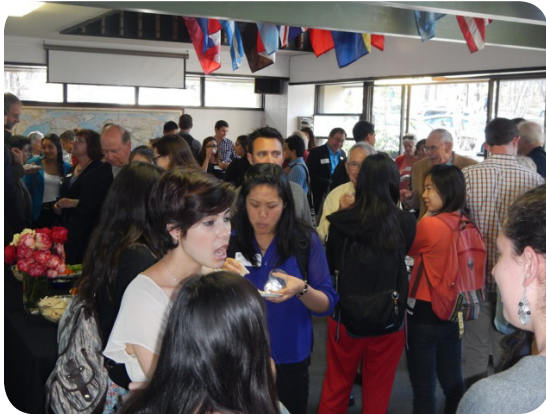
Annual Dinner, May 2013

NON-PROFIT ORG. U.S. POSTAGE PAID SAN DIEGO, CA PERMIT #1909