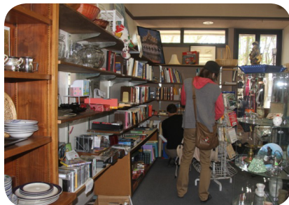
Friends Resale Shop

The group fluctuates with number of participants, but continues to be well attended.