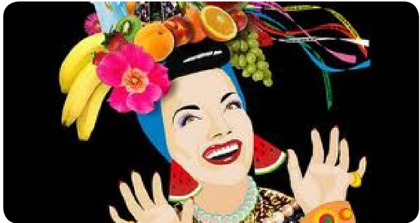
Brazilian performer Carmen Miranda noted for her outlandish fruit hats

A postdoc from Poland, a graduate student from Hong Kong, and members of the Friends are in deep conversation over a meal prepared in the International Center kitchen by our talented volunteers.