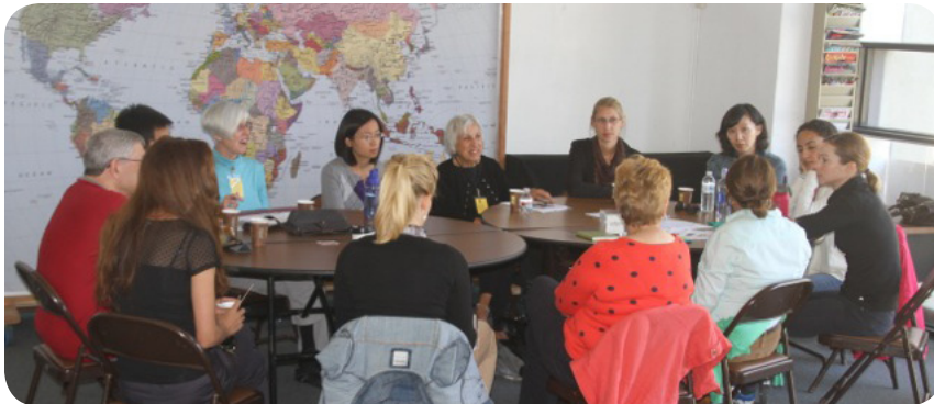
Gus' English Conversation Table