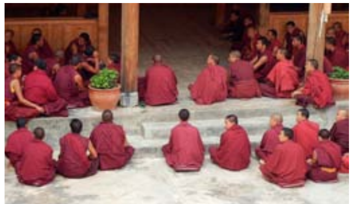
Bamboo Grove Monastery

Our host institution in Shangri-la was the Shangri-la Institute for Sustainable Communities (SISC), which operates a series of "Yangtze water schools" devoted to teaching people about the importance of cleaning up the upper Yangtze, given its importance to most of central China. This has been a great success, they told us, with branches in hundreds of schools, and has been supplemented by a series of freestanding community centers intended to promote traditional arts and crafts and the study of Tibetan.