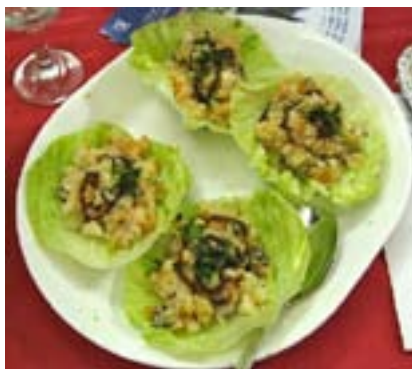
Blossoming Lotus: diced shrimp with bamboo shoots, black mushrooms, water chestnuts in a lettuce cup