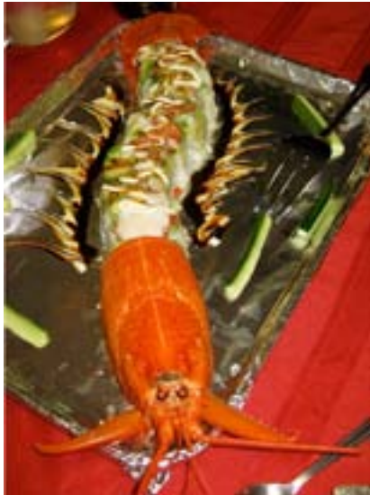
Crouching Dragon: lobster with tempura shrimp, avocado, and cucumber