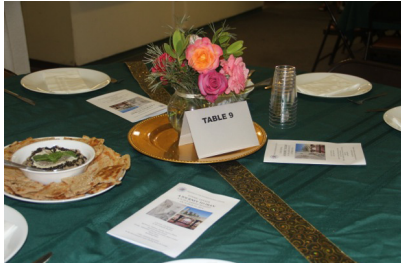
The tables are set with festive ribbon, gold platter under bouquet of flowers, dinner programs, and kashk bademjan , an eggplant, walnut, cheese dip appetizer