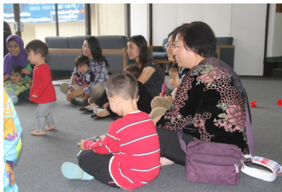
Mommy/Daddy & Me class