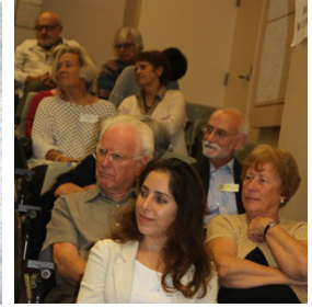
An engrossed audience