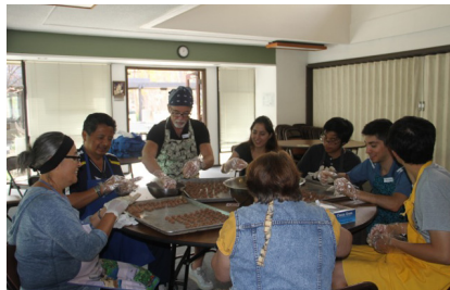
It takes many to roll the more than a thousand tiny beef meatballs for kalam polo , a traditional Persian rice dish with meat and cabbage. Our “rollers” come from Peru, U.S., Iran, Indonesia, Hong Kong, and Brazil