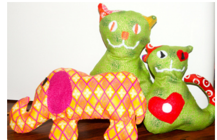
Three of the many different stuffed animals our Wednesday Coffee group has been sewing to be presented by Santa this year