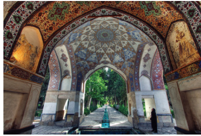
Photos of two of many Iranian architectural wonders shown on the virtual tour Door knockers indicate different entrance for women (left) and men (right)