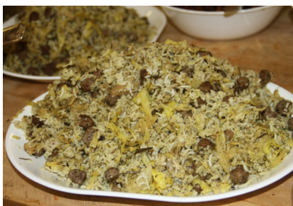
The finished kalam polo . Presented at each table on large platters, all dishes were served family style