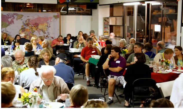
An overflow crowd listens to the speakers