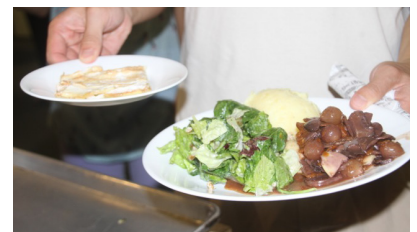
Salad, mashed potatoes, coq au vin and apple tart on separate plate