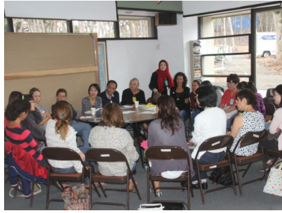
Gus' English Conversation Table