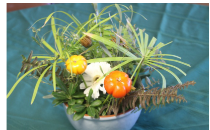
One of many centerpieces made by Wednesday Coffee crafters