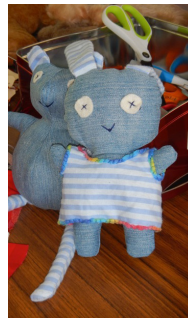
Sample of the many stuffed toys made