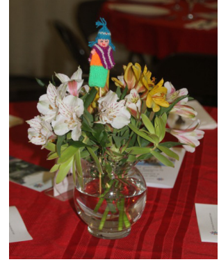
Alstroemeria or Peruvian lilies with Peruvian folk art