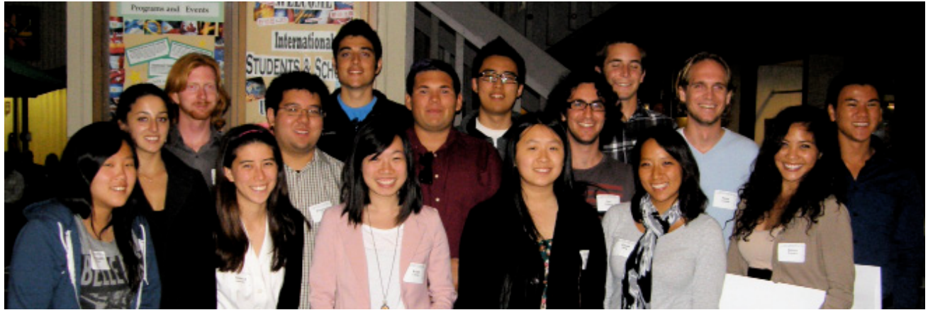
EAP students going to Australia, China, France, Hong Kong, Italy, Japan, Korea, Mexico, Russia, Spain, the UK, and Thailand