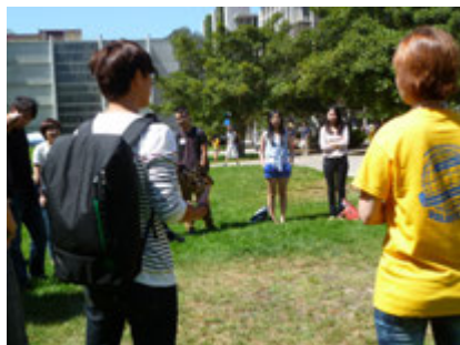
Icebreaker: the student with the backpack is holding a bean bag