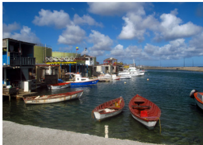
Experiments above water

I am a doctoral student in marine biology at the Scripps Institution of Oceanography, and I am grateful to have been awarded a scholarship from the Friends of the International Center. I used this award to travel to Curaçao, where I spent two months