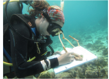
Experiments under water

I study coral reef conservation biology. Worldwide, we are losing coral reefs due to a range of problems caused by humans: runoff from coastal development and agriculture, overfishing, climate change, and ocean acidification are some of the major issues. When coral reefs begin to die, many of them are overgrown with seaweed. My dissertation is about the interaction between coral and seaweed. Ultimately, my goal is to better understand the ecology of coral reefs, so that we can find new and effective ways to protect them.