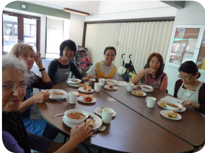
Participants enjoy the dishes they helped prepare