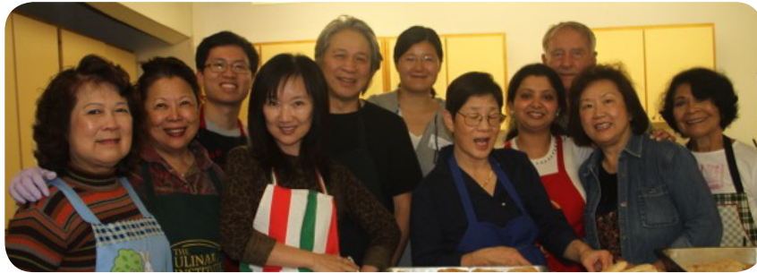
Some of the large kitchen crew