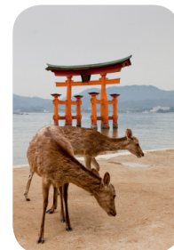
Sika deer at floating gate at Itsukushima