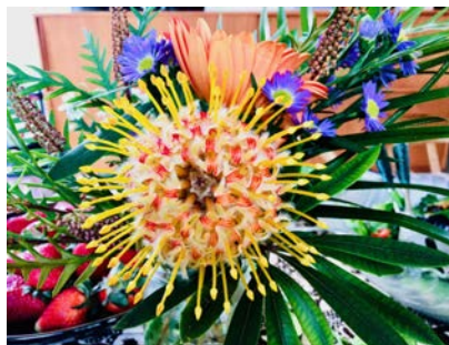
Protea from Candace Kohl's garden

not in the least bit greasy, despite the cook having had to fry enough to serve 100 guests; the wonderfully tender and flavorful beef satay; and an interesting version of gado gado with green tomatoes, amongst other Indonesian dishes.