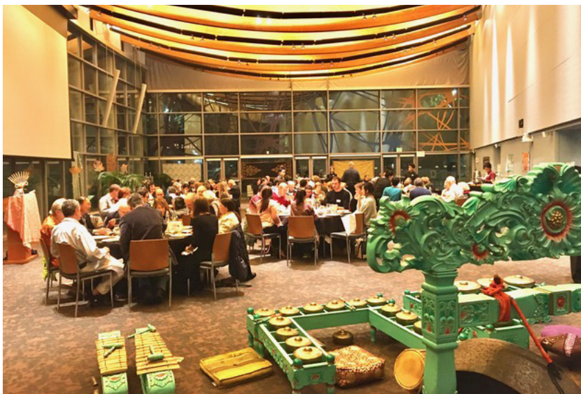
Great Hall with seated guests and gamelan instruments