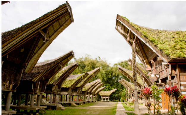
Tana Toraja houses