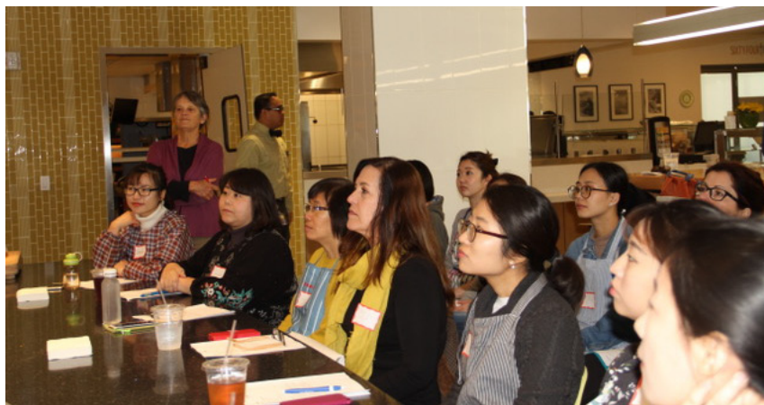
Students in the January class watch the chef's demonstration attentively