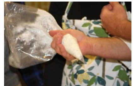
Correct way to hold a pastry bag

Everyone gets a turn at helping to prepare the food and later on to taste it. Classes fill up quickly and it is clear that participants enjoy learning new things and meeting fellow internationals, all while having fun and consuming delicious dishes.