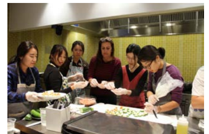
Participants practice making salmon topped cucumber canapés