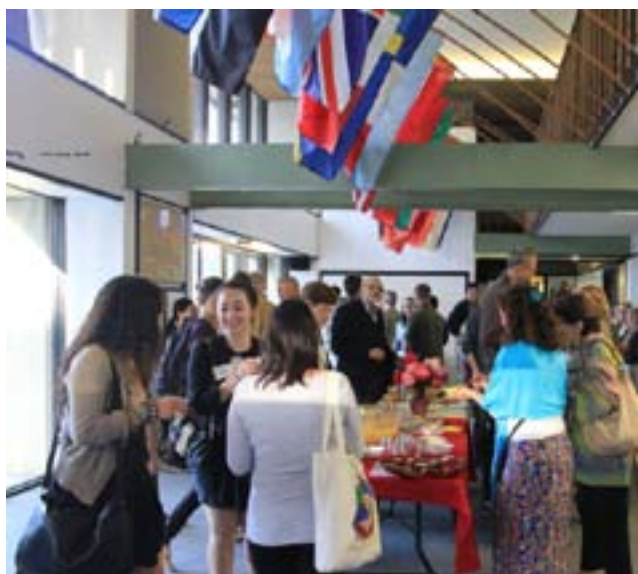
Guests mingle in the lounge

Coming as it does at the end of the academic year, the Friends Scholarship Awards Ceremony is the highlight of our year, where we celebrate the outstanding achievements of our scholarship recipients. The Friends enjoy playing host to our many guests, who—varied as they may be—are united in their support of international education at UC San Diego.